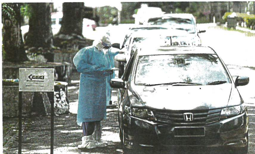
Rakyat Malaysia yang semakin prihatin dengan jangkitan COVID-19 memanfaatkan kemudahan ujian saringan secara pandu lalu di Pulau Pinang, baru-baru ini.