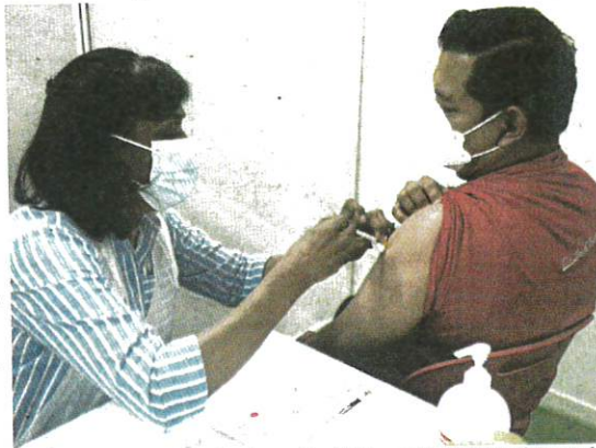
A health worker administering a Covid-19 vaccine booster dose at the Dewan Ang Si Chong vaccination centre in Butterworth yesterday.

He said although the Omicron variant caused milder symptoms and complications than other variants, the ministry had to im-