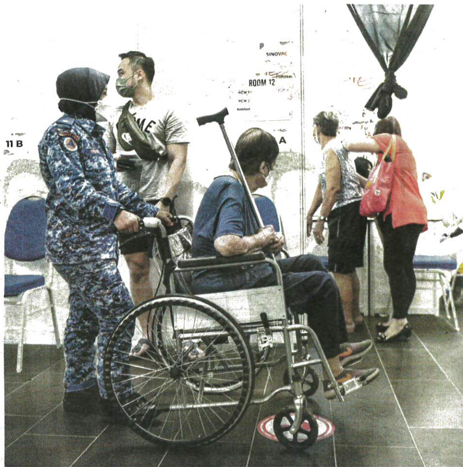
GOLONGAN warga emas menerima vaksin dos penggalak Covid-19 di Pusat Pemberian Vaksin (PPV) Axiata Arena, Bukit Jalil, kelmarin.