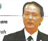
Dr Noor Hisham Abdullah, Ketua Pengarah Kesihatan

Daripada pesakit dalam kategori tiga hingga lima, sebanyak 71 kes atau 55.04 peratus membabitkan pesakit yang sudah mendapatkan dua dos vaksin.