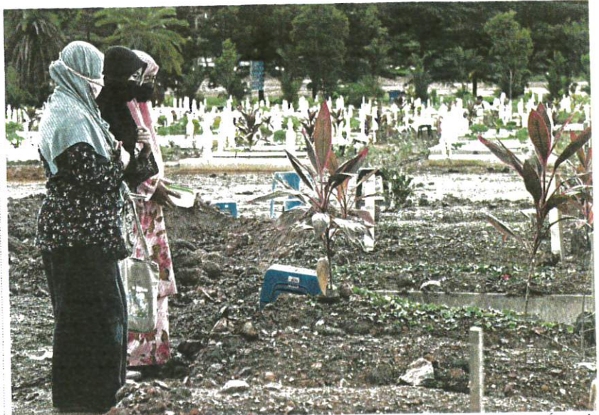
People visiting the grave of a family member who died of Covid-19 at the Seksyen 21 Muslim cemetery in Shah Alam on Saturday.